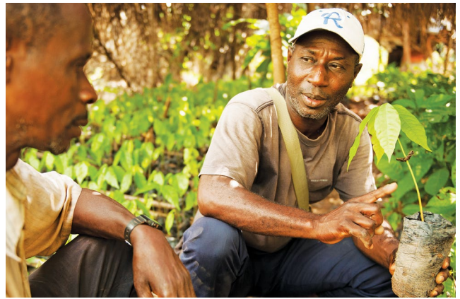
Cocoa growing in Ivory Coast