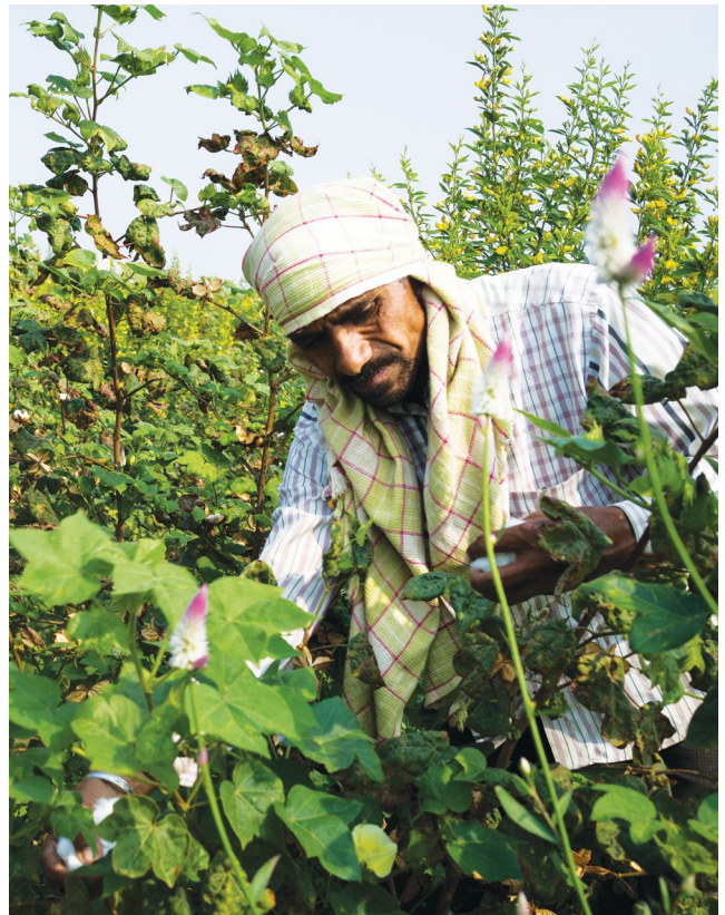
Picking cotton in India