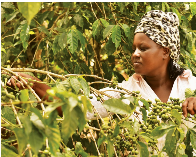
Coffee farming in Kenya | Photo: David Macharia