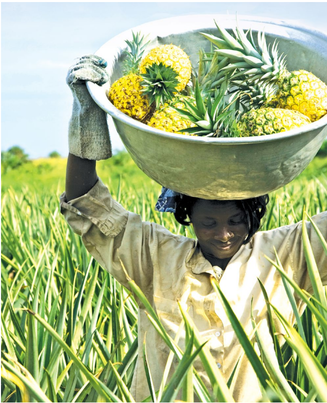
Harvesting pineapples in Ghana

While all these risks are real, the greater risk for workers and small farmers, at least in the short-term, is that HRDD continues not to be properly implemented. There is a risk that it remains or becomes a paper exercise for some companies.