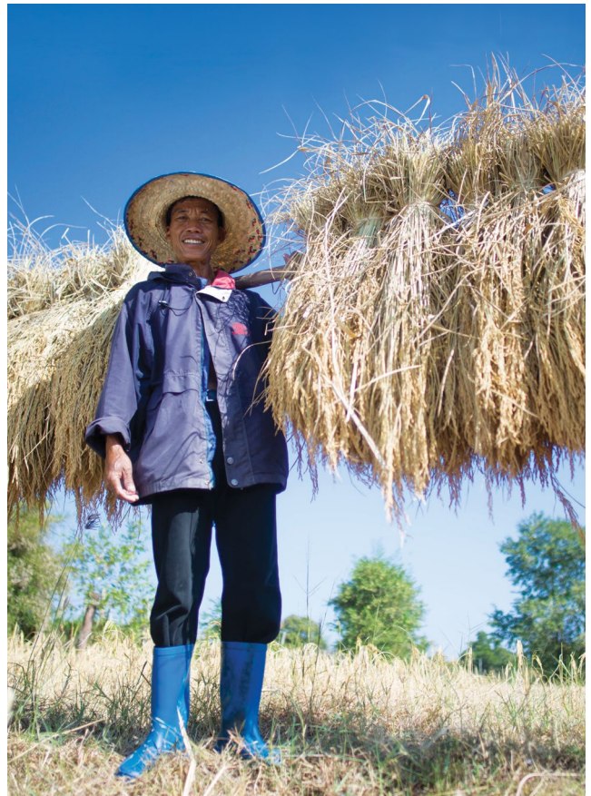
Growing organic jasmine rice in Thailand

The study is based on a literature review, conceptual work on a theory of change, interviews with a number of key informants and stakeholders, small case studies on garments (Bangalore, India) and horticulture (Kenya), plus further stakeholder consultations. While the limited experience and evidence around HRDD design, implementation and impact has proved to be a limitation, this study is an important first step in identifying and analysing the available evidence and the likely risks. Recommendations focus on improving the design and implementation of HRDD, and the additional measures needed, and are applicable at global, regional or national levels. The report serves as a basis for further discussion and research on how to ensure HRDD frameworks have a positive impact on small farmers and workers.