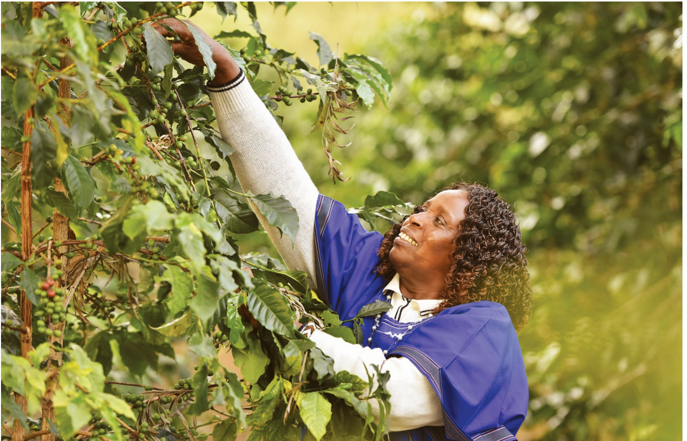
Coffee farming in Kenya