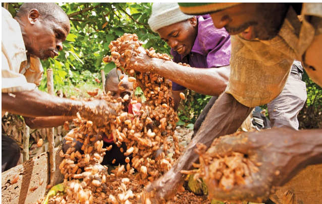
Processing cocoa in Ivory Coast

Due diligence is commonly used by companies to comply with legal obligations. Over the past 20 years it has been taken up in legal frameworks and instruments to address human rights issues in global and national supply chains. Moving beyond a concern with material risks to a company, HRDD addresses the salient risks of corporate practices in terms of impacts on human rights. Most of the frameworks are voluntary, but mandatory requirements have been introduced in France and the Netherlands (regarding child labour), and are under development in other countries, such as Switzerland. Binding measures include either legal reporting requirements, or more stringent examples of regulations requiring companies to implement due diligence processes including mitigation actions. HRDD is a process-oriented, rather than performance based standard, and comprises the following steps: identify, assess, prevent, mitigate, monitor and remedy negative impacts on human rights in the supply chain, and embed responsible business conduct into company policies and management systems. Voluntary global frameworks such as the United Nations Guiding Principles on Business and Human Rights or OECD Due Diligence Guidance set expectations on business, but do not create new legal requirements, and there are no provisions if there is a failure on the part of companies to comply. In contrast, mandatory HRDD require companies to conduct DD, and can lead to civil or criminal liability for any shortcomings.