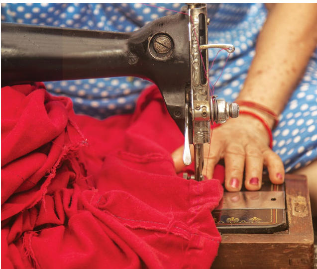
Sewing garments