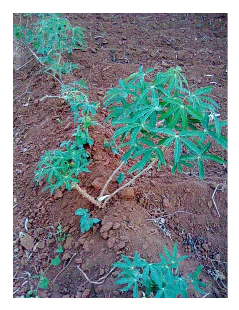
Figure 2: Cassava plant in Mulanje where most of the crop is planted as a hedge to demarcate one crop from the other

by both men and women. Knowledge in this regard was passed on from generation to generation and/or gained through extension services.