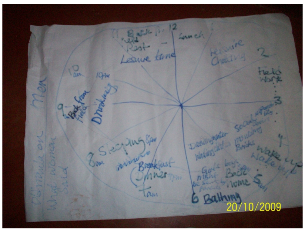
Activity profile of Old Maula