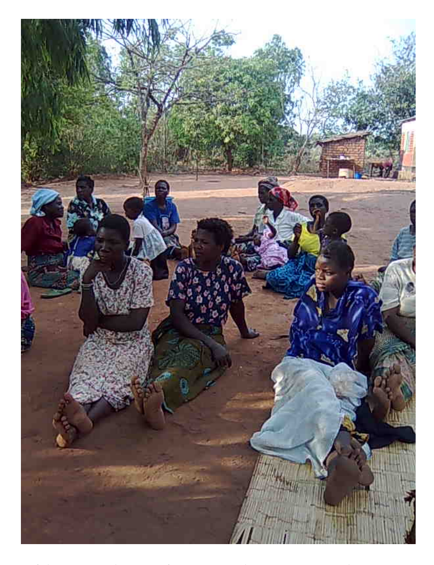
Figure 1: Some of the women during a focus group discussions in Mulanje

In terms of control, women farmers were found to have no control over the land they toiled on especially in the patrilineal societies visited in the northern regions. In patrilineal societies, land is conferred to males upon death of the male landowner. Women can only inherit land if they had positive relations with their husbands' relatives and if they had children.