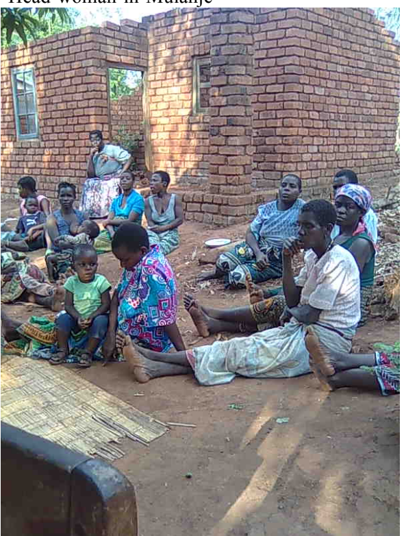
Tiyamike farmers in Mulanje