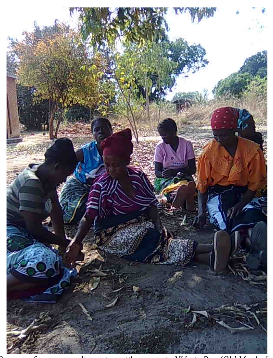
Figure 3: During a focus group discussion with women in Nkhata Bay (Old Maula farmers)

Processing was the most laborious of all cassava related activities in which women are involved as it is not mechanized and it is monotonous.